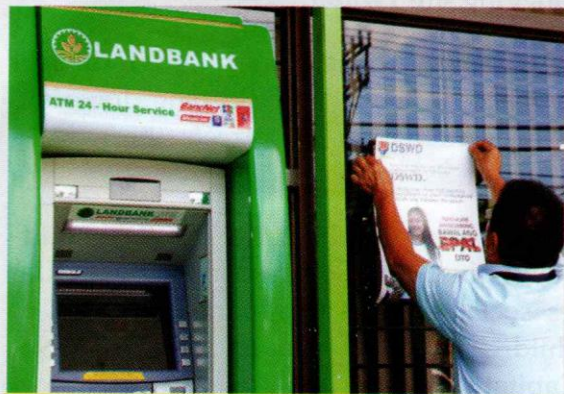
DSWD-NCR staff posting the BAED poster on LBP branch.

The Department of Social Welfare and Development in the National Capital Region (DSWD-NCR) intensified its ' Bawal Ang Epal Dito ' campaign in partnership with Land Bank of the Philippines (LBP), to protect the beneficiaries from partisan politics during the mid-term elections campaign.