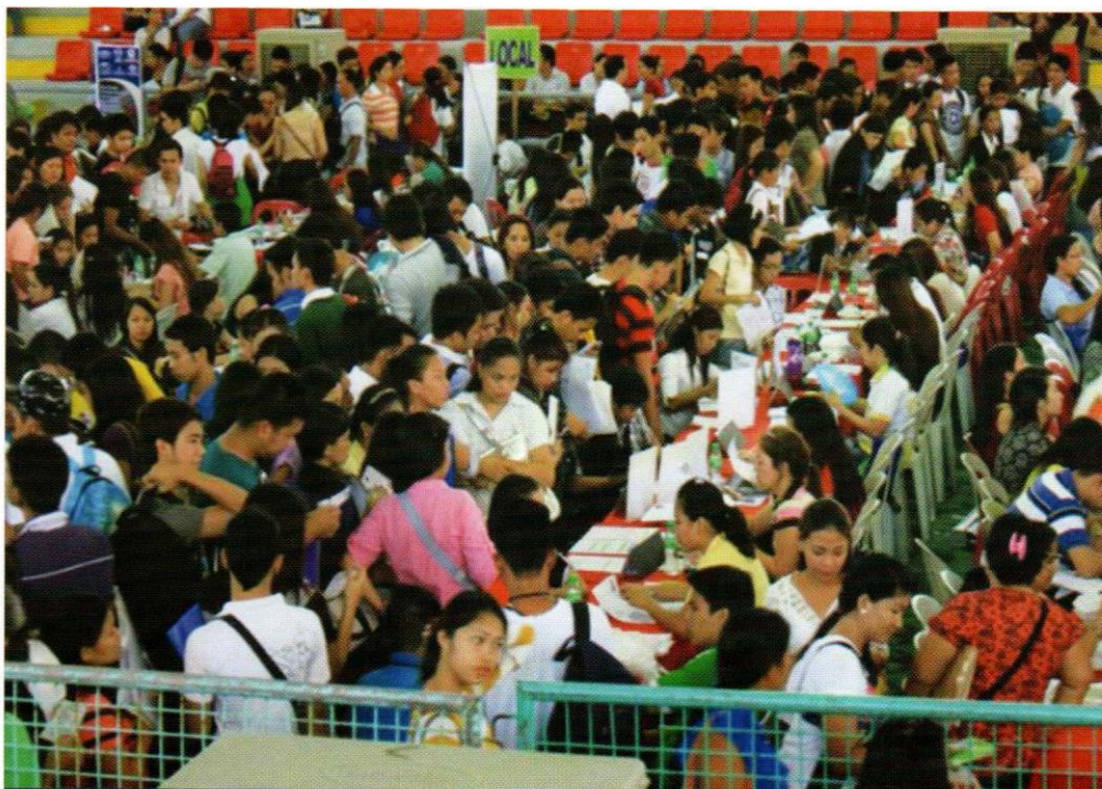
Beneficiaries of Pantawid Pamilya Program flocked to the different booths in the job fair.